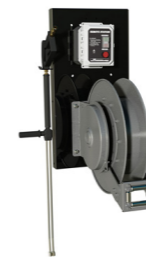
WALL MOUNT REM

Hydroblaster Remote Equipment Modules (REM) interface with Hydroblaster Systems and provide operators with full remote control of Hydroblaster systems.